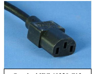
Standard IEC 60320 C13 receptacle is required for the Power Amp side.

*NOTE: Standard versions are wired for domestic use only. Export units are available on special order. Export AC Power Input range is 170-250 VAC, 50-60 Hz with a 4A 250VAC fuse. CAUTION: Voltages outside this range could damage the unit and cause a shock hazard.