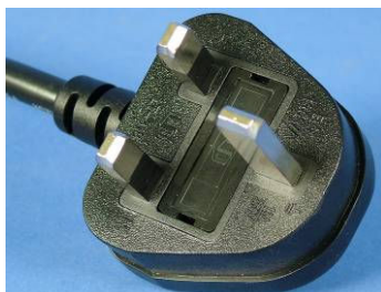
UK Plug BS1363A (Supplied with 13A fuse). Telonics # WI-008667-001