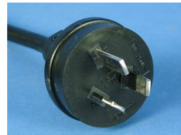
Australia Plug AS 3112 Telonics # WI-008668-001