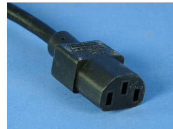
Standard IEC 60320 C13 receptacle is required for the Power Amp side.

CAUTION: Voltages outside this range could damage the unit and cause a shock hazard.