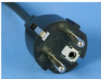
Europe IEC 884/CEE7-VII Telonics # WI-008669-001